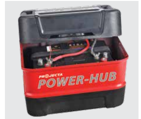
Compatible with a wide range of battery types & styles

The Power-Hub is ergonomically designed for outdoor applications with gutters moulded into the top housing to allow water to drain away from vital electrics, weatherproof covers to shield the plugs and sockets with a slot allowing the cords to remain plugged in while the cover is closed. Soft touch over-moulded handles provide maximum grip comfort and double as tie down points to secure it from moving around your vehicle.