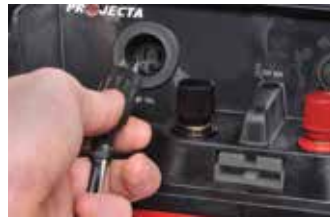
10A Engel Type Socket