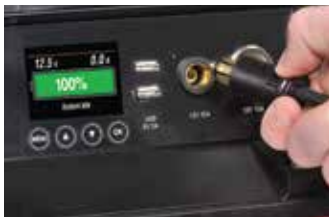
15A Merit Socket