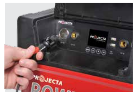
10 Versatile power outlets