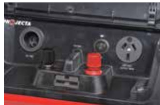
50A Heavy Duty Connector and DC Terminals