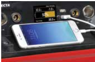
2A USB Sockets